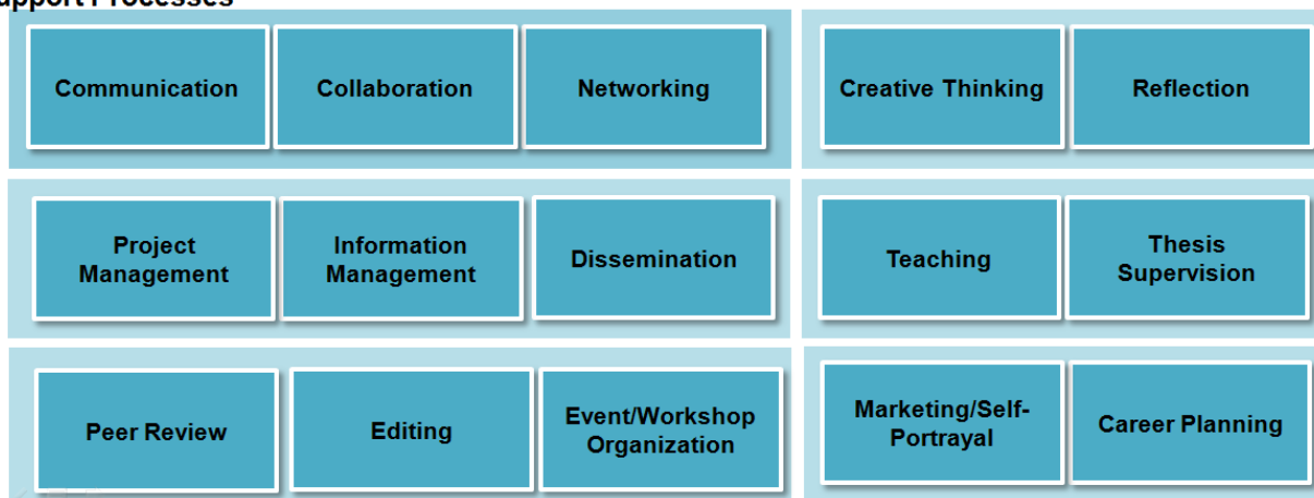
Figure 2. The TEL Research Process Map